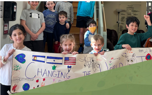
Changing the World Together

Looking for a way to connect your family to Judaism and community in a hands-on, meaningful way?