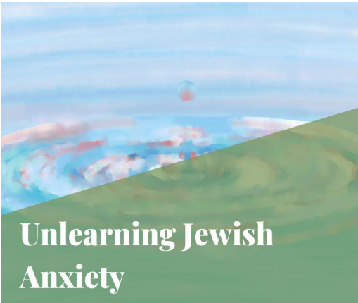
Unlearning Jewish Anxiety